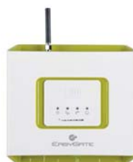
2N® EasyGate PRO

Today, an emergency communication solution is an essential part of every lift. It provides a connection between the lift and important technical support services, which enables you to call for expert help. Technologically advanced lift communicators from 2N also meet strict European standards (EN 81-28, 70) and, thanks to their easy operation, they are an important aid when performing regular or emergency service.