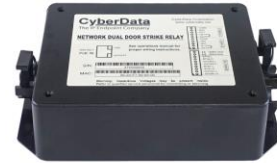
011375 Network Dual Door Strike Relay

CyberData's intermediate and network door strike relays eliminate the need for sourcing a separate relay and make wiring an electronic door strike easier.