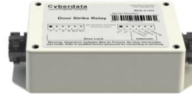
011269 Door Strike Intermediate Relay Module

When connecting a CyberData SIP or InformaCast® Enabled Intercom to an electronic door lock, the high current side of the door strike requires a separately-wired relay and protection diode.