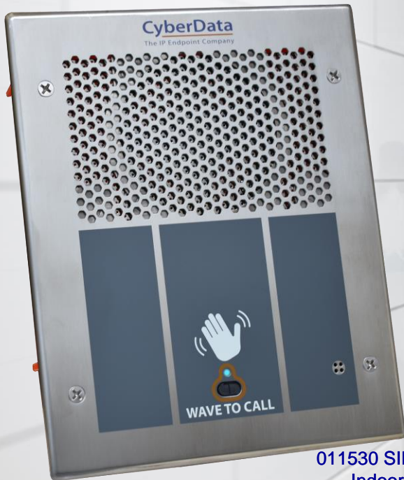
011530 SIP Hand Wave Indoor Intercom