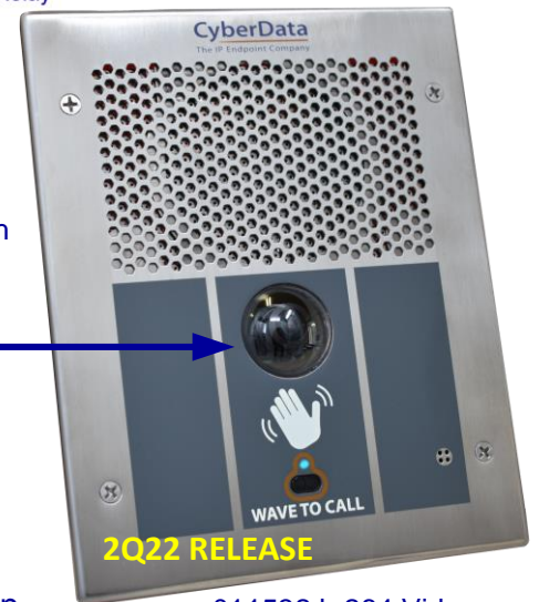
011532 h.264 Video Hand Wave Indoor Intercom

VIDEO OPTION COMING Q2 h.264 video with adjustable camera angle