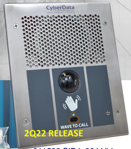
011532 SIP h.264 Video Hand Wave Indoor Intercom

Reducing exposure to bacteria, germs or viruses is a critical concern for many organizations in today's environment. Each touchpoint can be an opportunity to spread diseases.