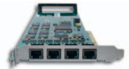
Diva Server V-Analog-8P

Diva Server SoftIP is a software-based adapter supporting Voice over IP (VoIP). With Diva Server SoftIP, calls that arrive via a VoIP network can access the same speech engines and applications that work with the Diva Server hardware. Diva Server hardware and software solutions can run together, in the same server, and can even interconnect calls between VoIP and traditional networks.