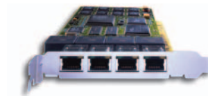
Diva Server V-4BRI-8

The Diva Server V-BRI-2 and V-4BRI-8 are V-series adapters for ISDN Basic Rate connections, available in single BRI (2-channel) and 4-BRI (8-channel) variants. They have on-board DSPs and support the full range of basic IVR and enhanced features including conferencing, echo cancellation and VAD.