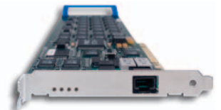
Diva Server V-PRI/E1-30 Diva Server V-PRI/T1-24

The Diva Server V-PRI/E1-30 and PRI/T124 are single-span E1/T1 V-series adapters, supporting 30/24 concurrent calls. Additional on-board DSPs mean that all channels can support the most demanding applications, with VAD, generic tone detection, large conferences and full support for ASR and TTS applications with barge-in.