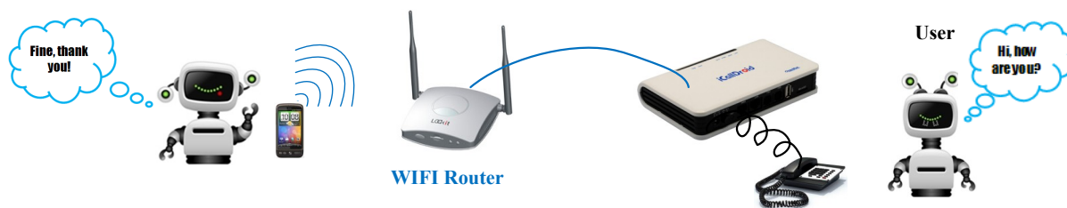
Scene 1. The two parties are at home, and they call each other through WIFI network and iCallDroid. Calls between them are free of charge.