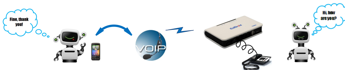
Scene 2. If the user is a VOIP user, he/she can make calls through iCallDroid appliance and VOIP network which can save much costs.